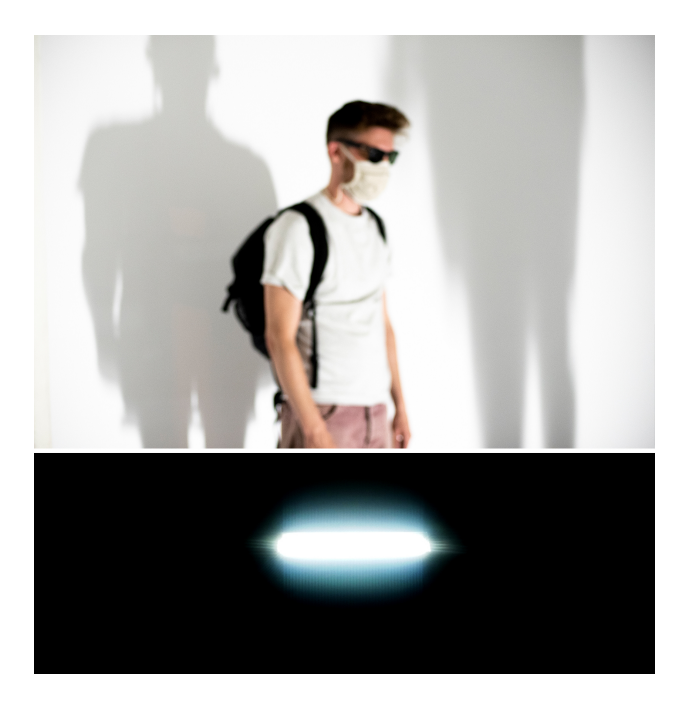
Figure 2. I/x as exhibited in Ljubljana in 2020 (above) and a discrete light impulse at the lower image (below).

tation of the two developed mathematical procedures will be presented in the second section of the paper. The third section of the paper is devoted to the spatial dimensions of the installations in relation to sonic and light contexts respectively. The artistic considerations behind how and why those mathematical devices were employed, along with a discussion concerning the exhibitions, will be exposed in the final section of this paper.